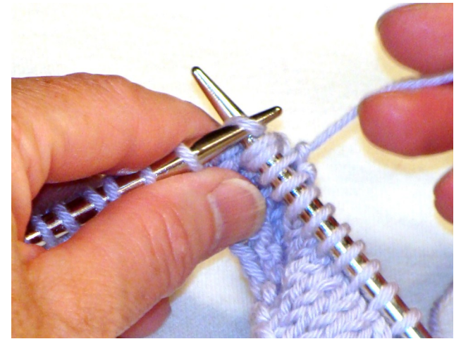
3. Knit next stitch from left needle.