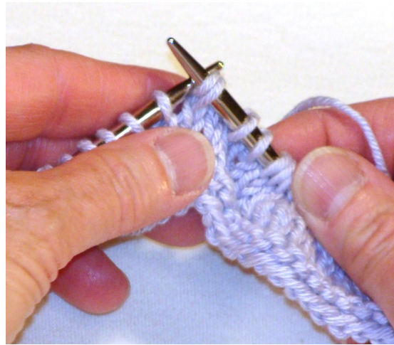
2. Slip next two stitches together as if to knit 2 together.