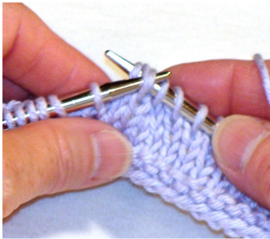
4. Pull the two slipped stitches over the stitch just knit as if they are one stitch, without changing the position of the stitches.